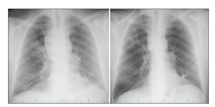
Figure 2: Regression of the lesion was observed on chest X-ray after chemotherapy

Due to the prolonged life span and the treatments applied, it can be said that the increasing number of lung cancer patients has been followed up in the ICUs for disease-related or treatment-related reasons.<sup>[5]</sup> The indications for ICU hospitalization may be cancer related (e.g., critical organ involvement and pulmonary embolism), may be associated with treatment (e.g., sepsis and drug toxicity), or may be due to comorbid diseases (e.g., kidney failure, heart failure, and chronic obstructive pulmonary disease attack).<sup>[5,6]</sup> However, apart from all these factors, the most common reason for cancer patients to be followed up in the ICU is acute organ failure, usually one or more of the following: