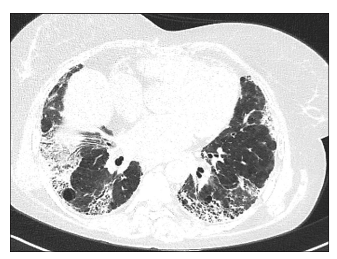
Figure 3: Fibrotic changes with bronchiolectasis and peribronchial thickening in the control chest computed tomography

commonly affected organs are the pancreas and salivary glands. Lung involvement is relatively uncommon. [3] The symptoms vary based on the involved organ and the severity of the involvement. Even some patients are asymptomatic. Almost every organ involvement has been reported so far. [4] IgG4-RD develops usually in the middle-ages and more common in males. [5] Patients with lung involvement may have symptoms such as cough, dyspnea, hemoptysis, and chest pain. Serum IgG4 is usually high, with a level of more than 140 mg/dL. Besides, it can be normal in 25%. [6] Hence, elevated IgG4 levels support the diagnosis but are not essential for it. In a previous study, researchers used the IgG4/IgG ratio and suggested that IgG4/IgG ratio >0.08 had a high sensitivity (97%) and specificity (95.5%).[7] Our patient was a young female, suffering from dyspnea and cough for a month and she had a normal serum IgG4 level and IgG4/IgG ratio was 0.052.